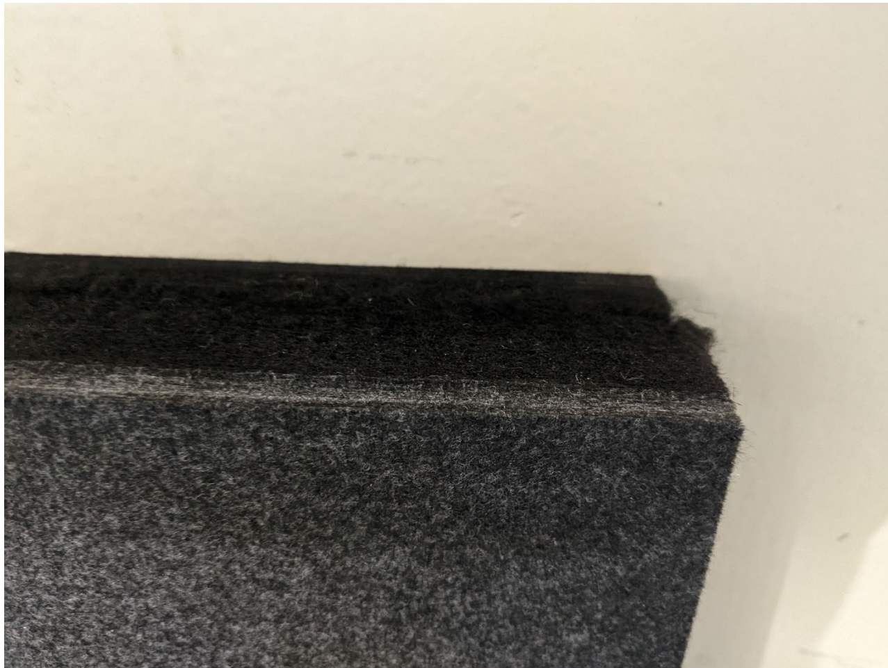
Figure 3 – Detail of specimen materials